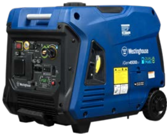
Recalled Westinghouse iGen4500DF Dual Fuel Portable Generator