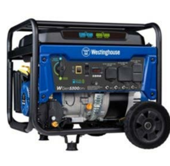
Recalled Westinghouse WGen5300DFv Dual Fuel Portable Generator