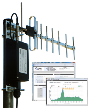
(Product shown with optional AW11-900 Antenna)

To speak to a live technician, please call technical support at the number below during normal business hours.